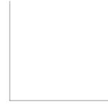
Fig. 1. Sequence of 2AFC trials with states H^n determined by a two-state Markov process with switching probability \mathbb{P}(H^n \rightarrow H^{n+1}) . For instance, H^{1/4} \rightarrow D ( H_C; H_C; H; H_C ) could stand for the drift direction of each drift-diffusion process y^n(t) corresponding to the decision variable of an ideal observer making noisy measurements, x^n(t) . The decision threshold ( \theta ) is indicated by a vertical line on the y-axis.