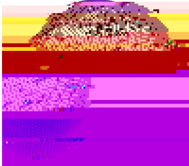
Figure 3.2. Positions of 7212 quadrature nodes of a quadrature integrating exactly all spherical harmonics in the subspace of maximal order and degree 145. This quadrature has efficiency \epsilon = 0.98521\dots

uniquely determine the number and type of generators for which the triangle P_0P_1P_2 serves as a template. Thus, t and s uniquely determine the total number of unknown parameters in the nonlinear system (3.7). We illustrate this construction in Figure 3.3.